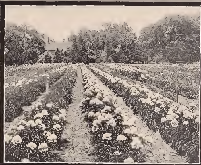
A BLOCK OF PEONIES IN OUR NURSERY